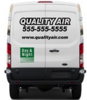
KUV / Utility Truck DN19-04UT

*Requires vehicle measurements for custom fit