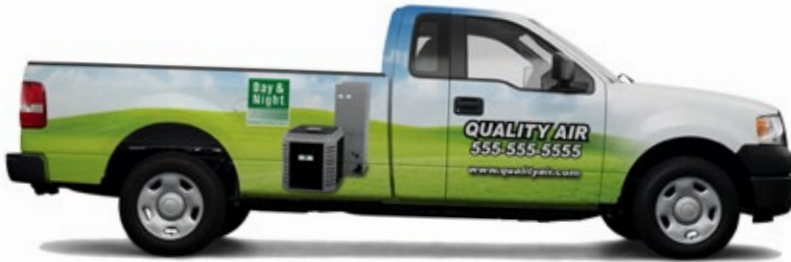
Pickup Truck DN19-05PU