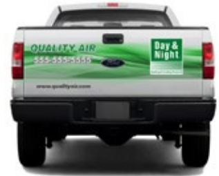
Crew Cab Pickup Truck DN19-02CC