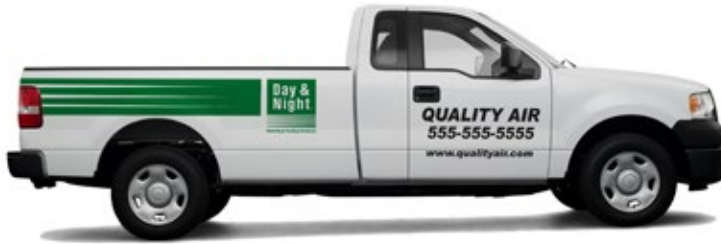
Pickup Truck DN19-06PU