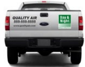
Crew Cab Pickup Truck DN19-06CC