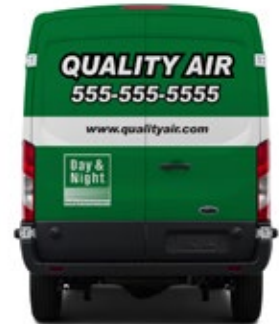
KUV / Utility Truck DN19-01UT

*Requires vehicle measurements for custom fit