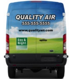
KUV / Utility Truck DN19-05UT

*Requires vehicle measurements for custom fit